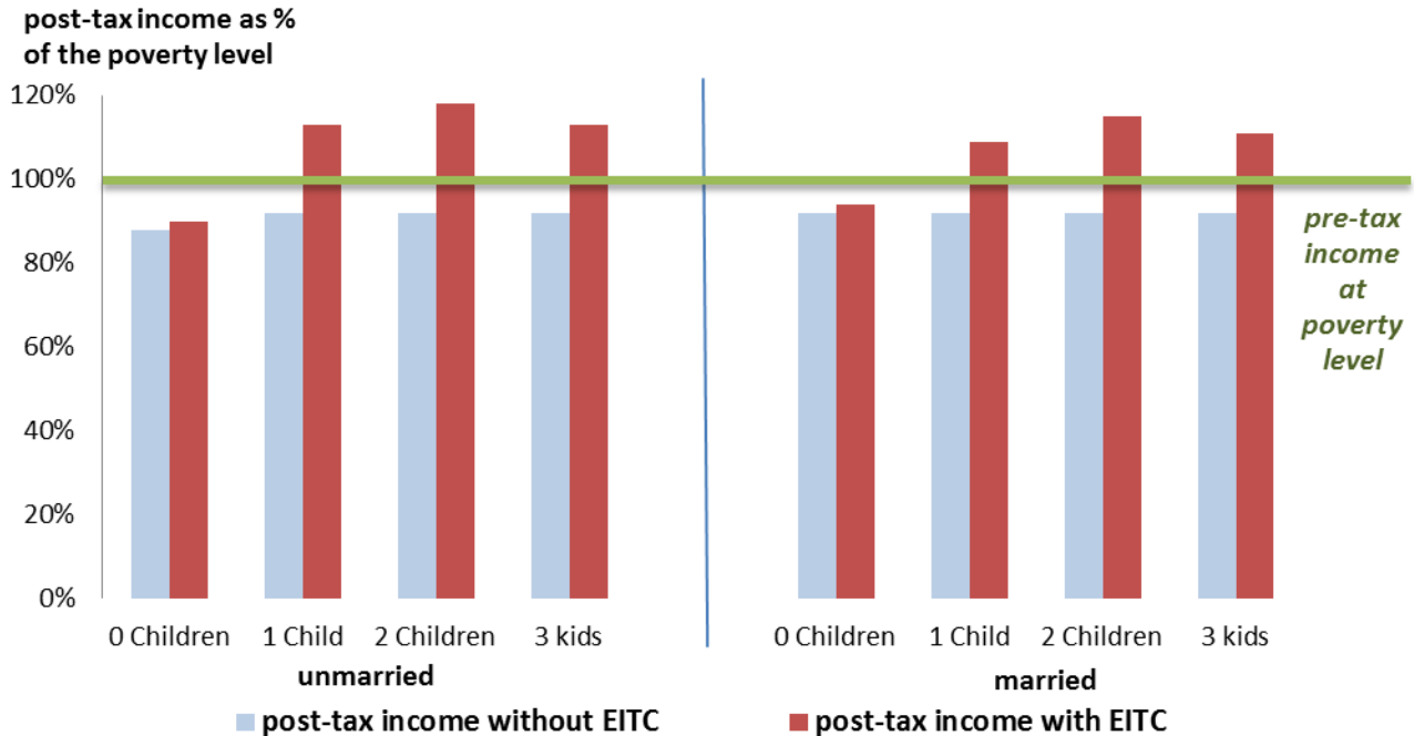
Figure 2. Effects of Taxes and EITC on Taxpayers at Poverty Level, 2014

including the EITC. In contrast, married and unmarried workers with children whose pre-tax income is at the FPL will have post-tax income above the FPL because the EITC is greater than their payroll tax liability. Many poor tax filers, especially those with children, do not generally owe federal income tax. 58